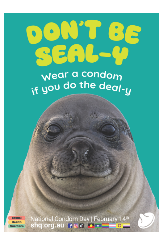
National Condom Day 2025 A3 posters